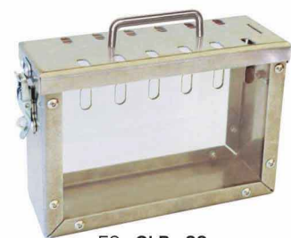
ES - GLB - SS