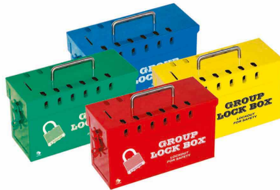
ES - GLB - R 13