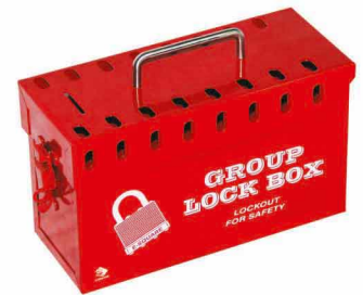
ES - GLB - R 17