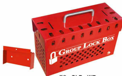
ES - GLB - WB