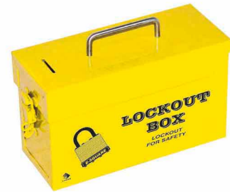
ES - LB - Y