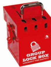
ES - GLB - R 7