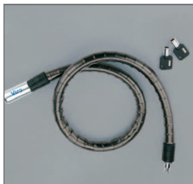
Keys with ergonomic grip