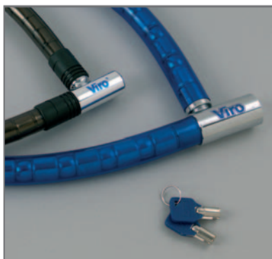
Scratchproof plastic cover